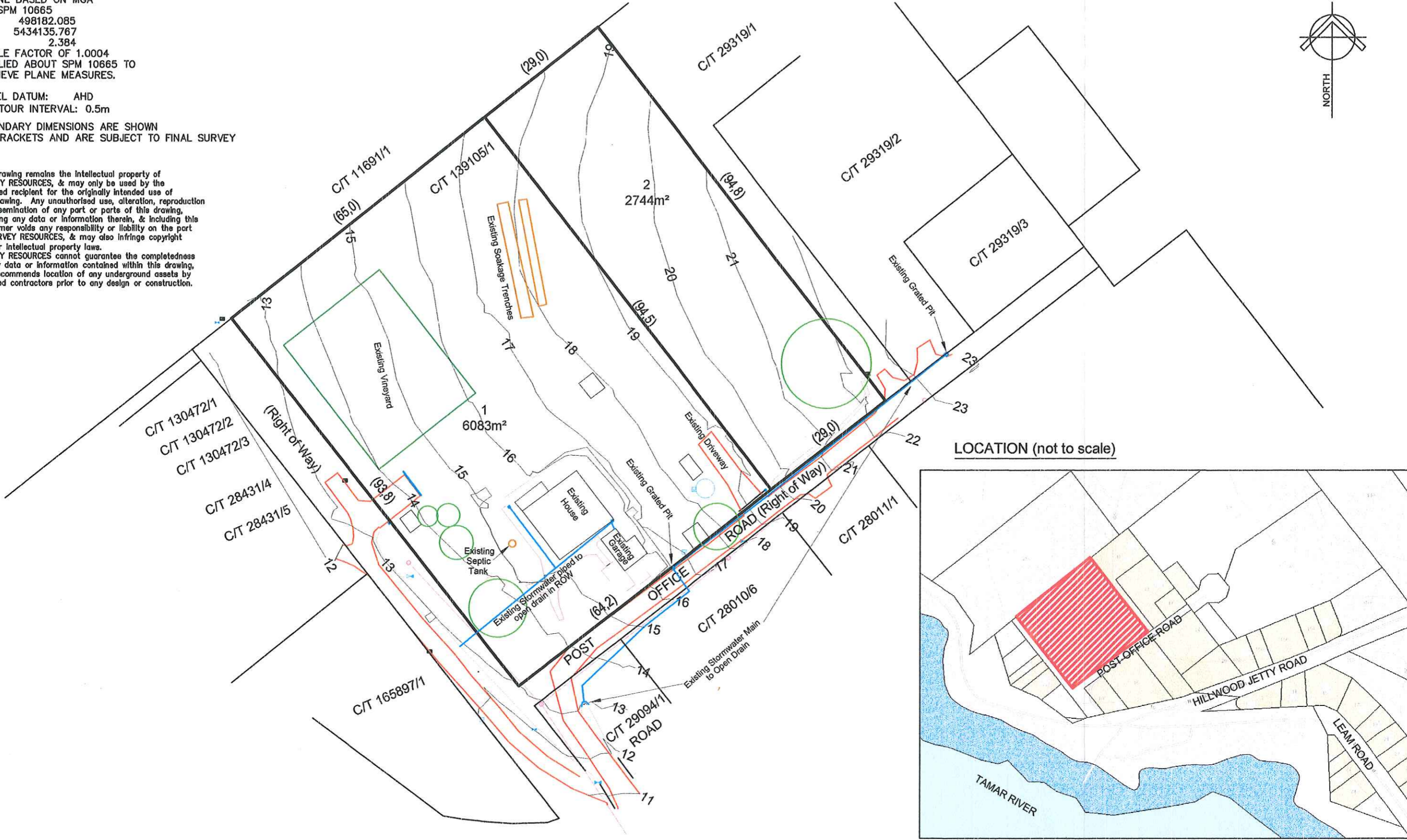
LOCATION (not to scale)