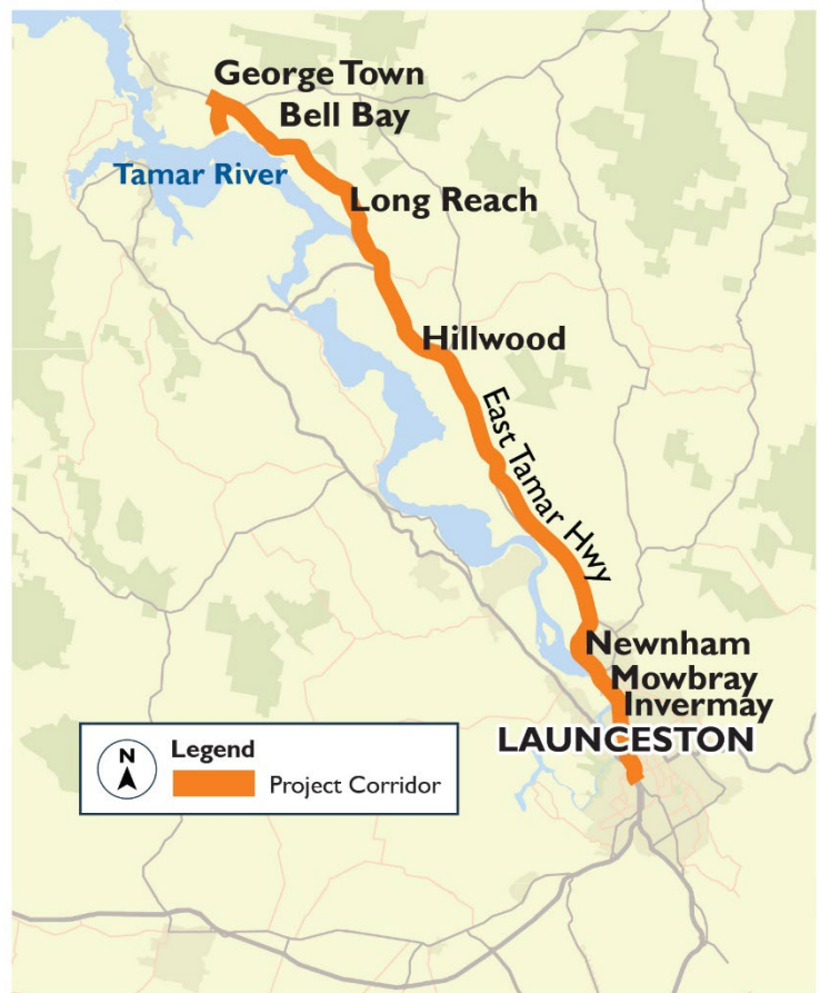
Project corridor location

The East Tamar Highway Corridor Strategy extends for 49 km between the Wellington Bathurst Street couplet from Frankland Street in Launceston and the Bell Bay rail underpass on the southern approach to George Town. The study area also includes the 2 km of the Bell Bay Road south from the intersection at East Tamar Highway to the Port at Bell Bay.