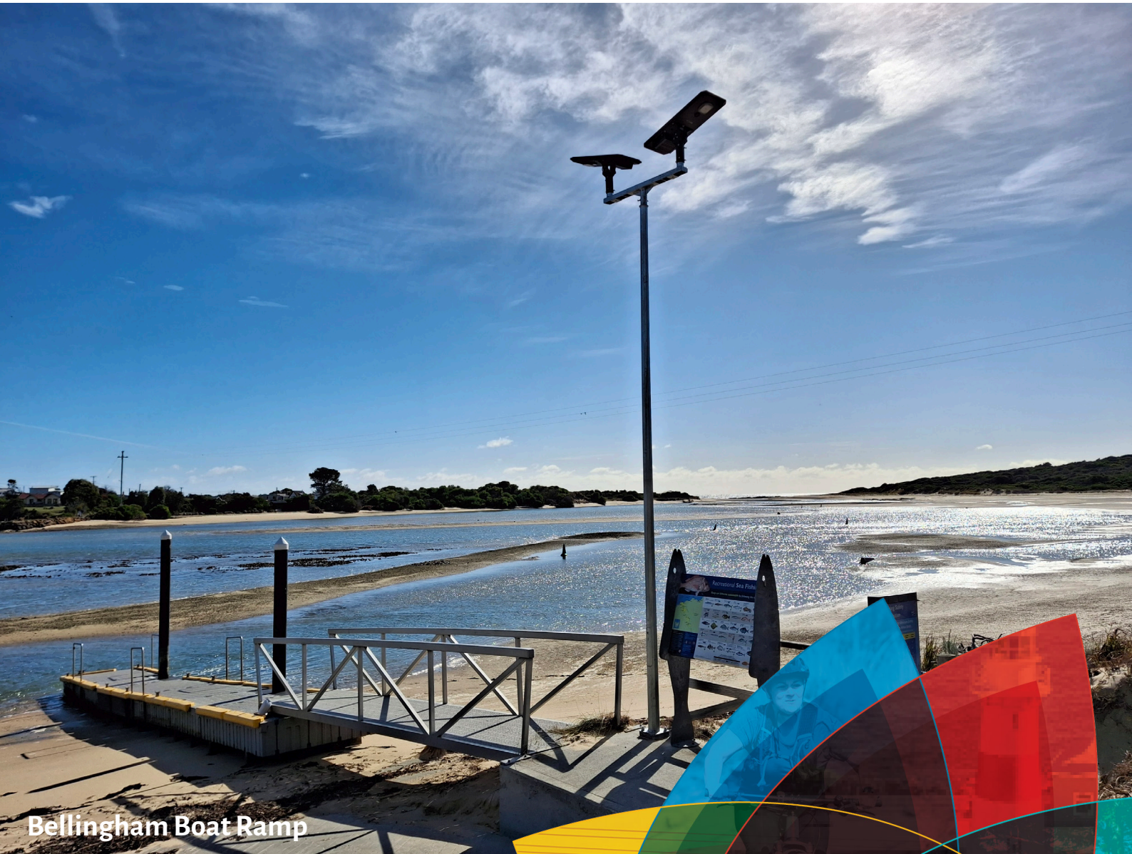
Bellingham Boat Ramp