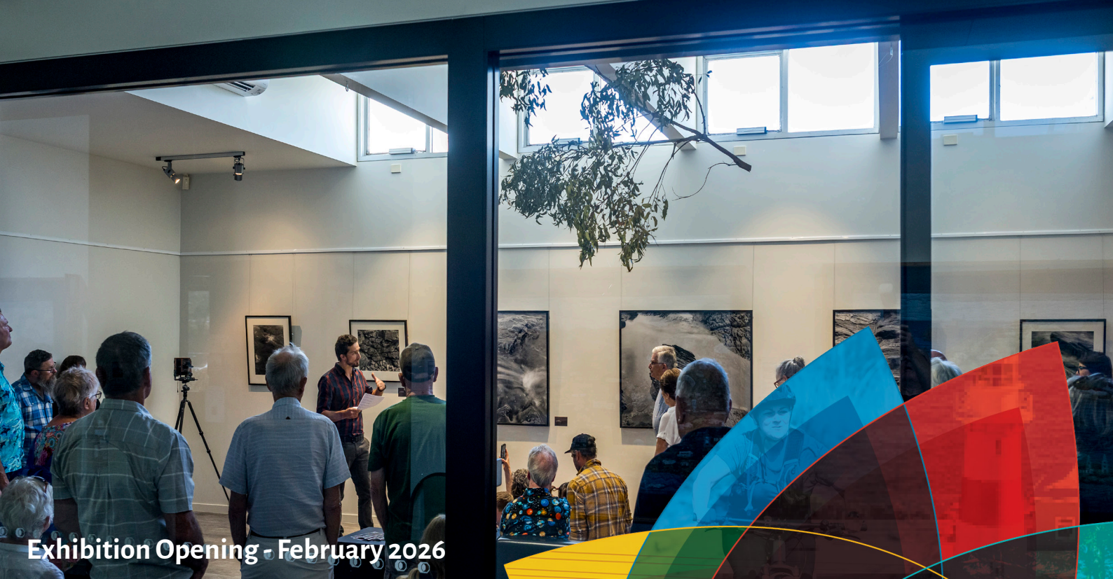
Exhibition Opening - February 2026