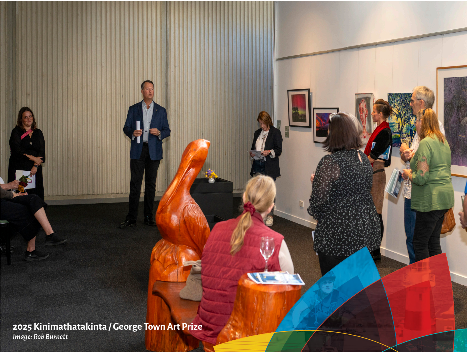
2025 Kinimathatakinta / George Town Art Prize